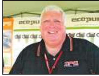
By Tom Bock

In the past two months I have had numerous calls about fuel filter contamination issues. They usually start with my fuel filters keep clogging up or I have oil in my fuel because I see black residue in the fuel filter. Many of the callers are requesting that the fuel be analyzed to identify the problem. While fuel analysis is available it is costly and requires special containers to protect from leakage during shipping to the lab. (Never send fuel samples using glass jars or plastic bottles that degrade and rupture in transit) Fuel analysis is usually used by companies with underground tanks to ensure the fuel is not contaminated or not of the cetane levels they are purchasing. There is no need to spend $$$ on analysis to identify the problem. There are a few types of fuel contamination that will clog that you can identify with a plastic tube and some white paper towels. Dip the tube down to