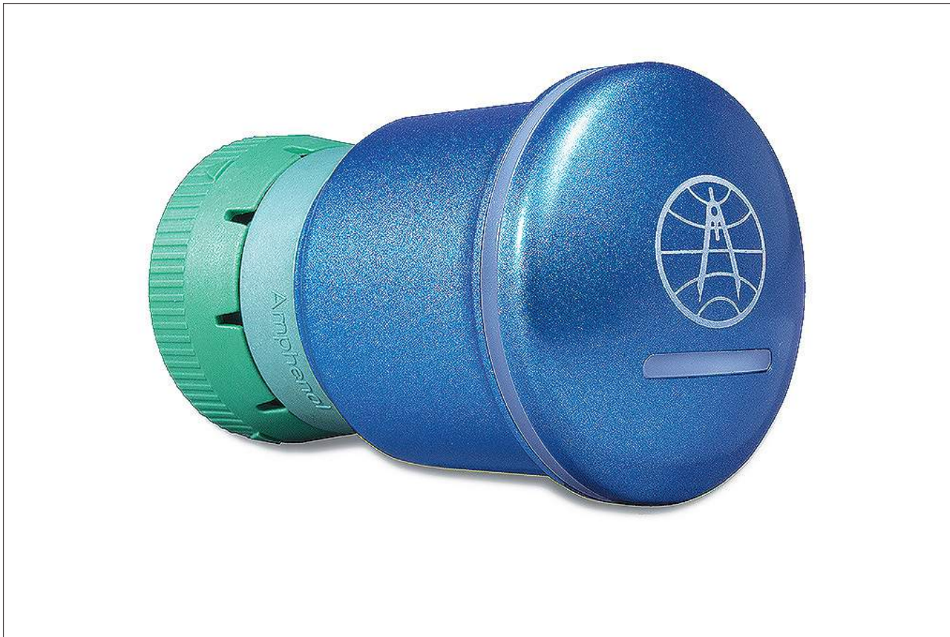
Rand McNally ELD 50 - ©Rand McNally