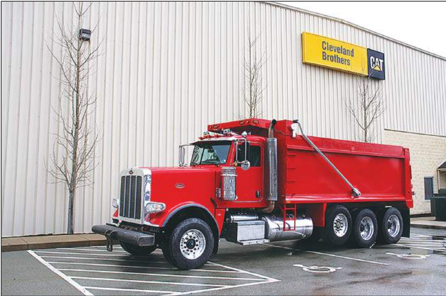
Cleveland Brothers is an authorized dealer for ITI Trailer and Truck Bodies. The company offers complete installations as well as parts, service and warranty support from all 13 Cleveland Brothers branches.