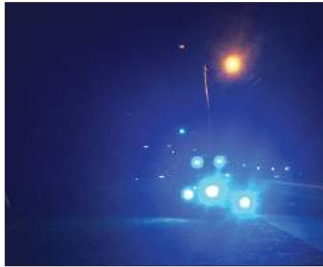
How quickly do we call 911 when there is an issue on the highway related to our fellow drivers?

It just so happens that the very next day, I had a similar situation to