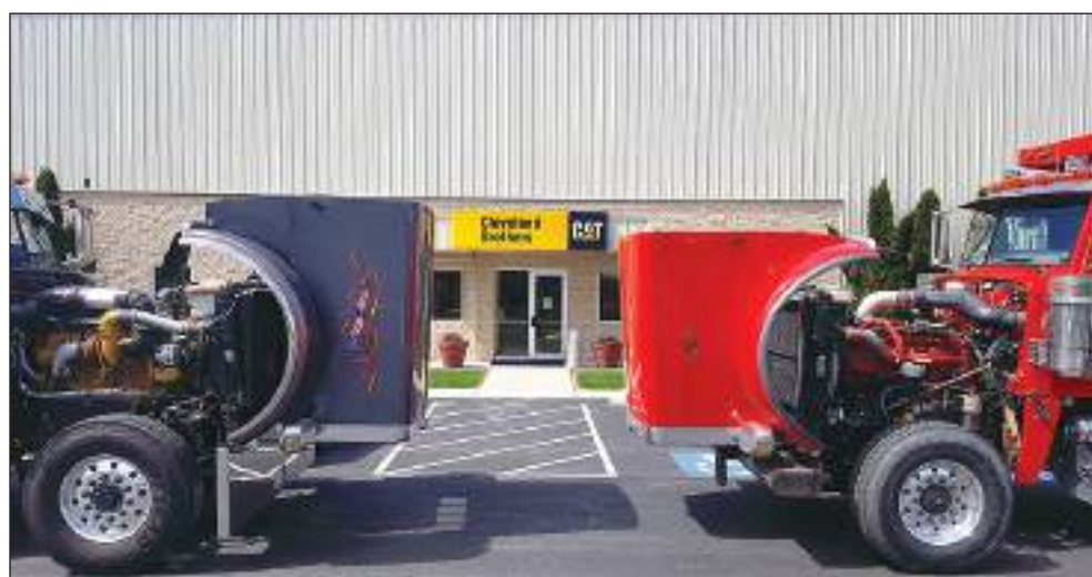
Cleveland Brothers offers bumper-to-bumper service for ALL makes and models of trucks.