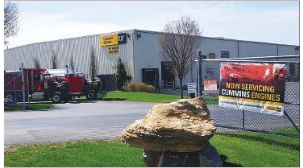
Cleveland Brothers' Manada Hill location, located off I-81 near Harrisburg, Pennsylvania.