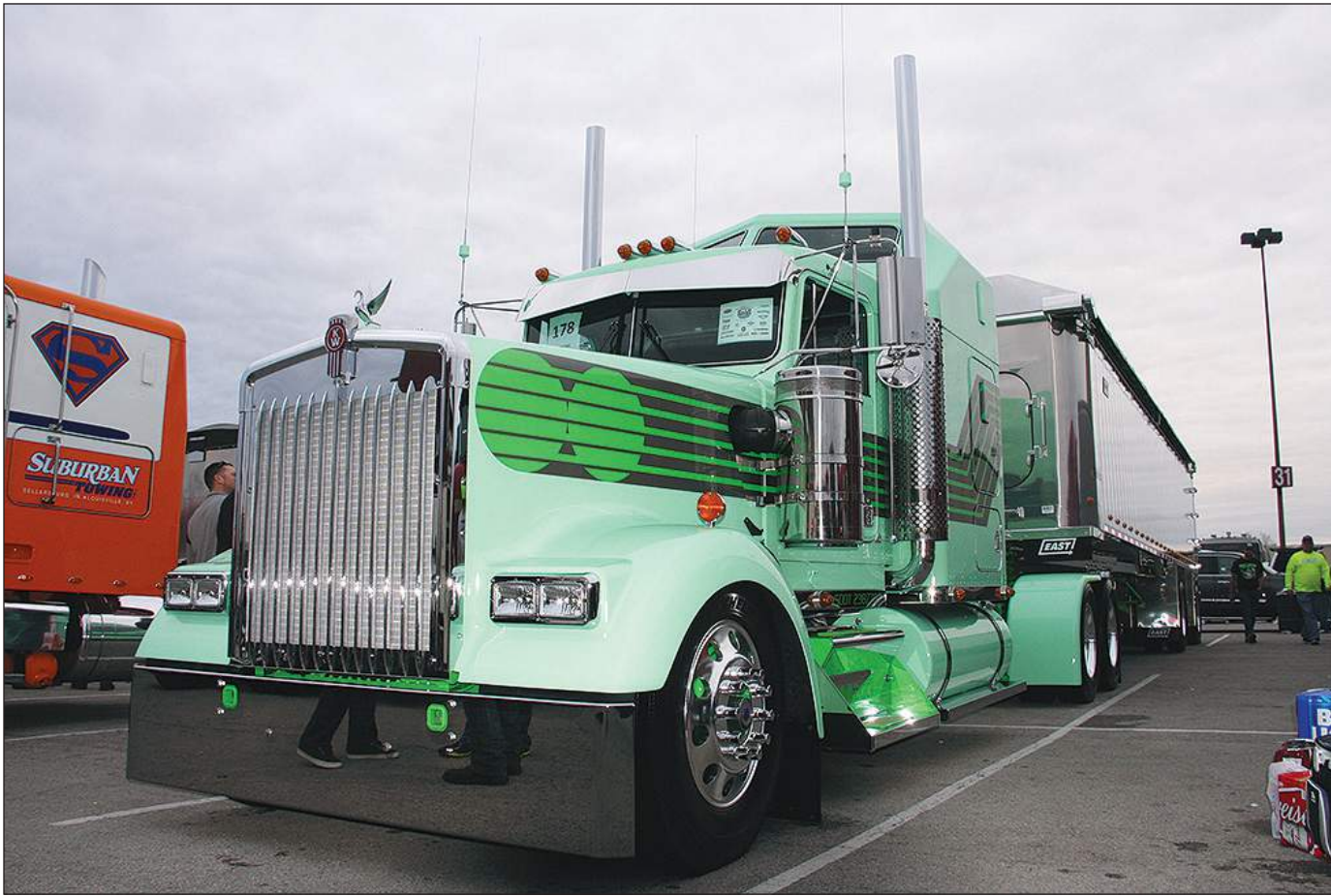
Beautiful rig in the PKY Truck Beauty Championship