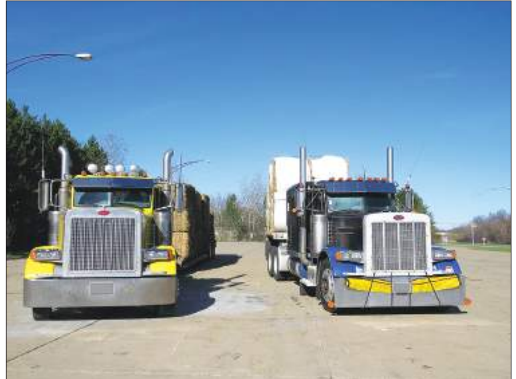
Book Family Farm of New Castle, PA donated hay to the Kansas farmers. The hay was transported to Ohio.