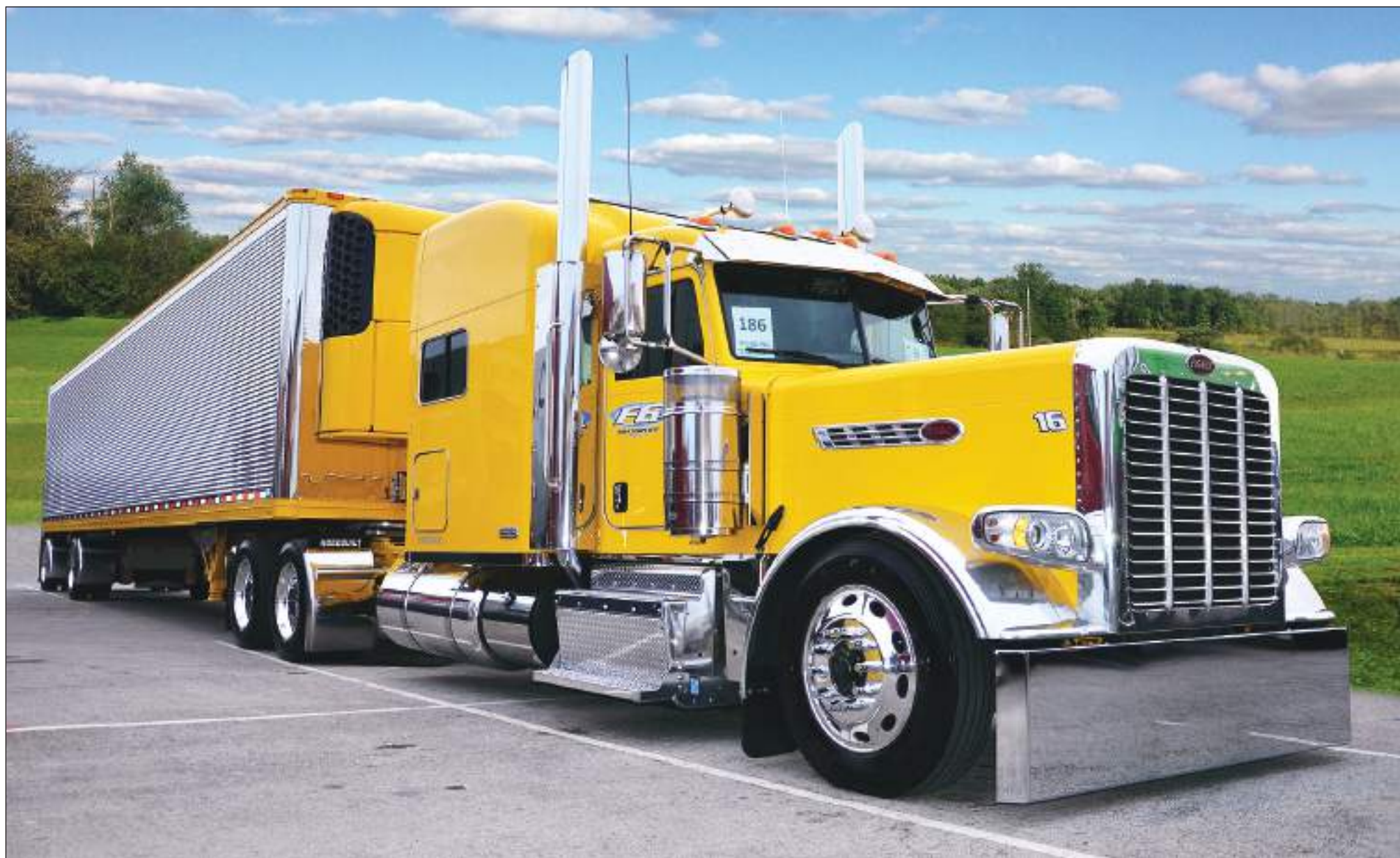
There were an abundance of beautiful Big Rigs competing at the PKY Truck Beauty Championships at the Mid-America Trucking Show in Louisville, Kentucky, held this past March. Turn to Pages 14 & 15 for more photos and the latest news from MATS.