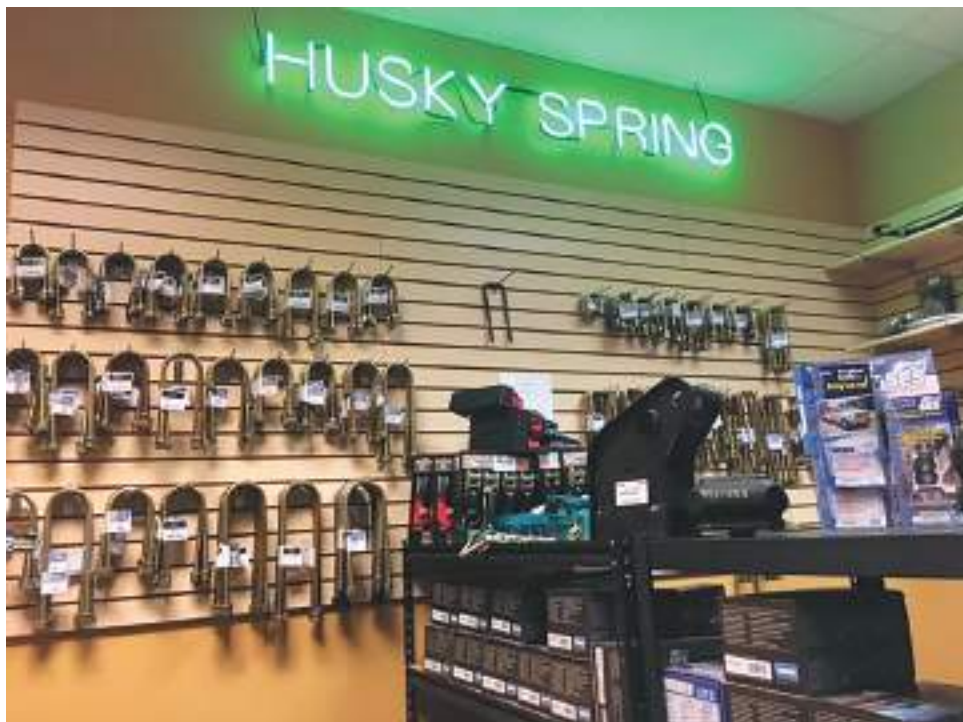
Husky Spring's location in Virginia, Minnesota.