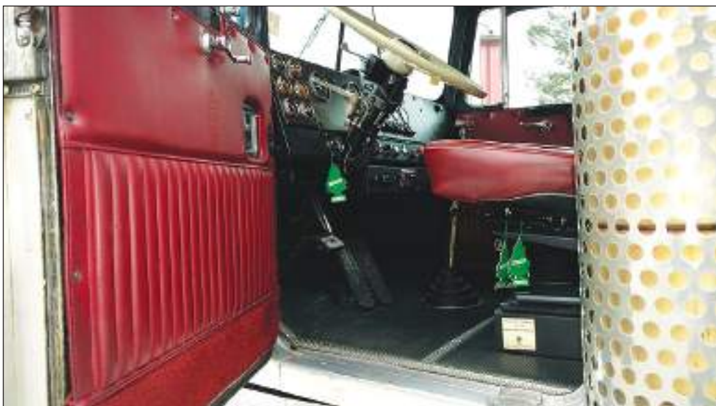
Back in the 1970s "anything goes" when it came to truck interior colors! This is the truck's original interior!