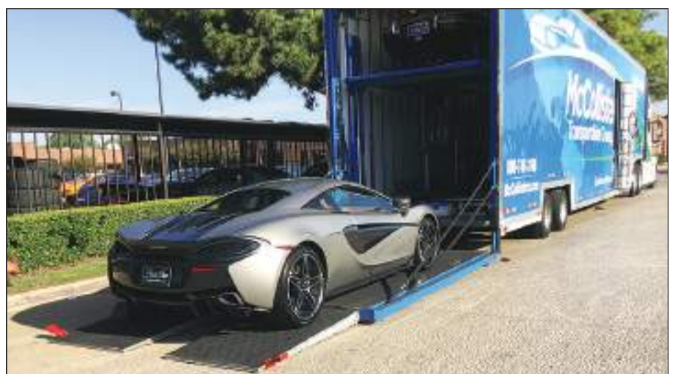
Enclosed Auto Transport can be a very interesting job.