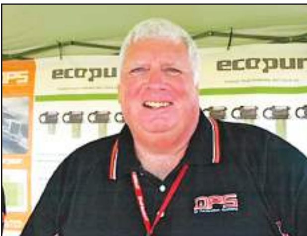
By Tom Bock

In the past few months we have seen a rise in the number of oil samples with higher soot levels. This increase is most likely caused by: excessive idling to maintain heat levels, clogged air or fuel filters, exhaust backpressure and possibly bacteria (BUGS) in the fuel.