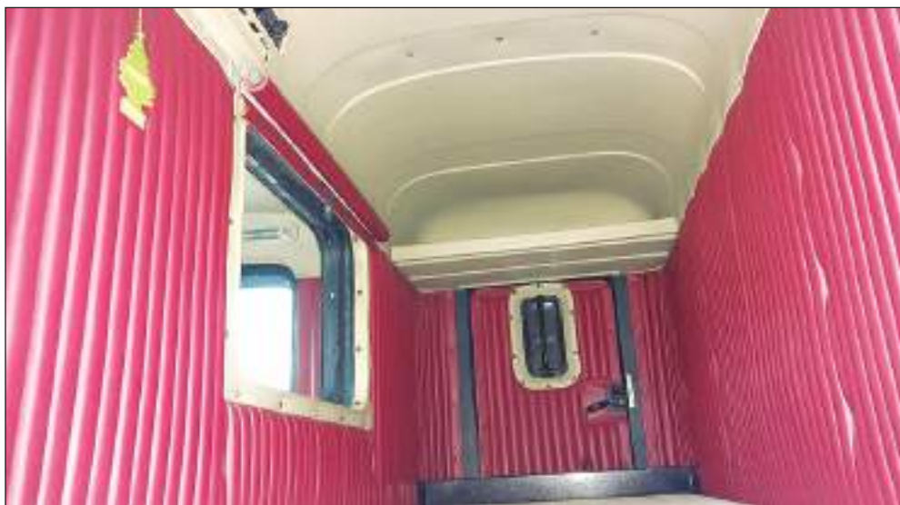
Interiors often didn't match the truck's color.